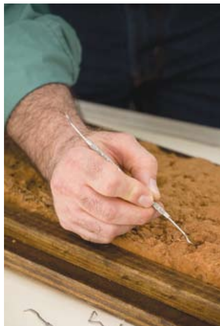
LEFT: Anacostia landfill soil from the 1970s. This touchable model is based on several soil samples taken in the 1970s from the Kenilworth landfill, Washington, DC. The original monoliths are in the collection of the Center for Urban Ecology, National Park Service. In the 1970s, the pit was filled with construction rubble and dirt. Trash was dumped and burned until 1968. Do you recognize any of this stuff? RIGHT: A monolith, or vertical slice from topsoil down to subsoil, preserves a soil's colors and layered horizons in position. Scientists make monoliths of the important soils in their region and use them in teaching. Back at the lab, the soil is "picked" away to leave about 1 or 2 inches of soil with a natural surface and then coated with glue or acrylic floor wax to "fix" it to the board.

ing as members of the SSSA Design Team or the Smithsonian's Extended Advisory Team (visit www.soils.org/smithsonian to view a list of donors, committee members, state liaisons, and supporters of the exhibition).