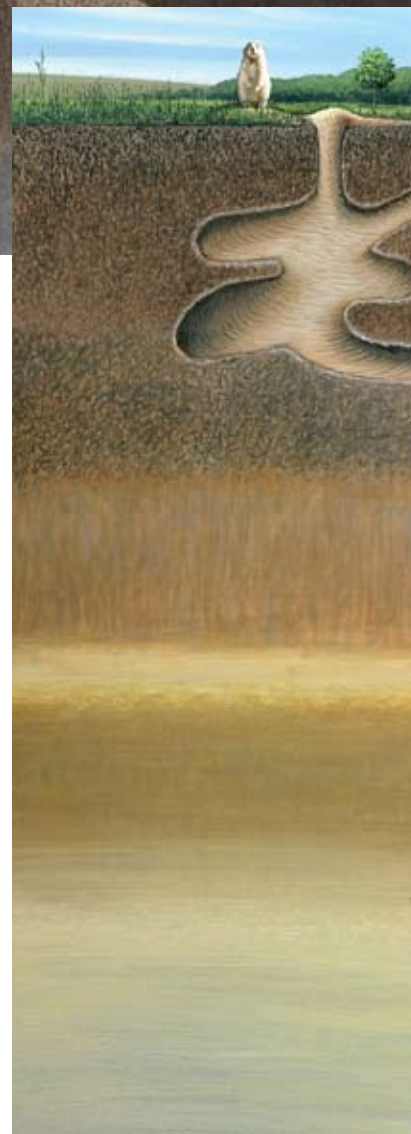
TOP: The earth’s “skin” is not one soil, but many soils—each with its own story. Tens of thousands of different soils cover the continents. ABOVE: Grassland soils are very fertile, in part because they formed under tall prairie grasses with deep, fibrous root systems. Over hundreds of years, the grasses added organic matter to the soils, producing a thick, fertile dark surface layer.