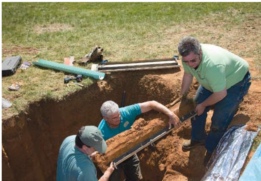
A monolith, or vertical slice from topsoil down to subsoil, preserves a soil’s colors and layered horizons in position. Scientists make monoliths of the important soils in their region and use them in teaching. As they pull the board back, they use strips of cloth to secure the soil to the board.

There’s no shortage of appreciation from SSSA and the Smithsonian for all the generous volunteers and donors who have supported the project. To date, more than 1,200 individuals have joined corporate, industry, and agency sponsors in supporting the exhibition with more than $2.3 million in contributions. The Nutrients for Life Foundation of The Fertilizer Institute is the lead sponsor of Dig It! , with additional support provided by several USDA agencies, including the NRCS, which loaned its collection of state soil monoliths to the museum for display in the exhibition. SSSA members and NRCS staff have also been generous with their time, act-