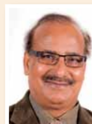
Hari D. Upadhyaya International Service in Crop Science Award