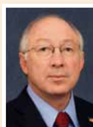
Ken Salazar SSSA Honorary Member