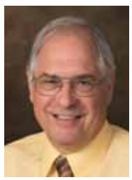
Douglas L. Karlen Environmental Quality Research Award