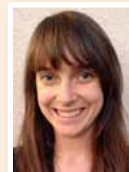
Thea Whitman Francis and Evelyn Clark Soil Biology Scholarship