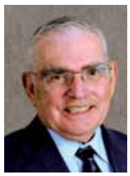
E. James Dunphy Agronomic Service Award