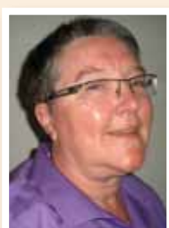
Helga Van Miegroet Mentoring Award