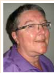
Helga Van Miegroet Mentoring Award