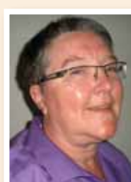
Helga Van Miegroet Mentoring Award