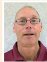
John Heard International Certified Crop Adviser of the Year Award