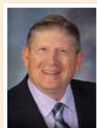
Ronald F. Follett Soil Science Distinguished Service Award