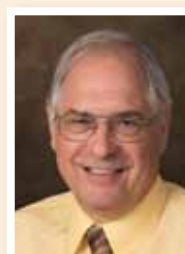
Douglas L. Karlen Soil Science Research Award